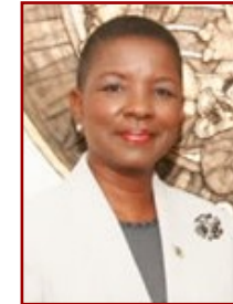
Mayor Shirley Gibson City of Miami Gardens