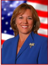
Mayor Lynda Bell City of Homestead