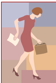
Mayor Herta Holly Village of Miami Shores