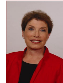
Mayor Susan Gottlieb City of Aventura